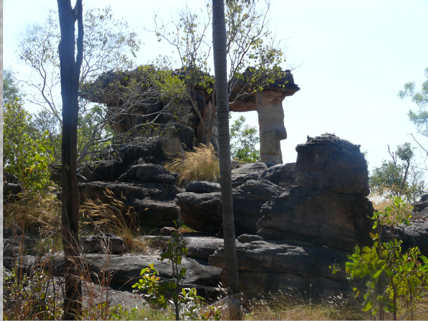
Rock Formations, Kakadu National Park